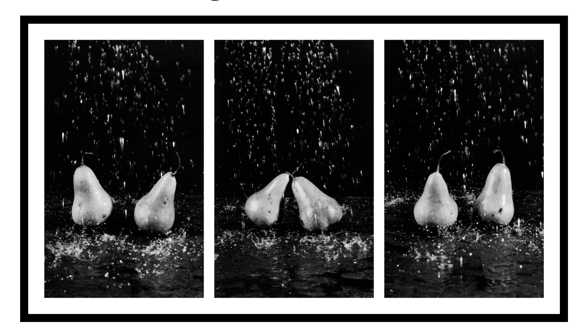
Jiving in the Rain